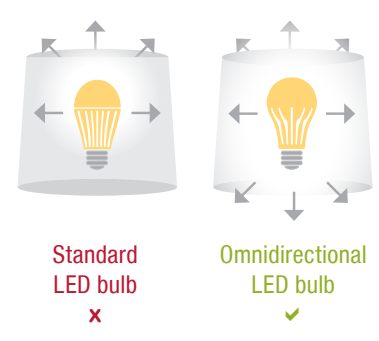
Table lamp comparison

In table and floor lamps, you want the lights to shine in all directions, so look for Energy Star®-labeled bulbs that are omnidirectional